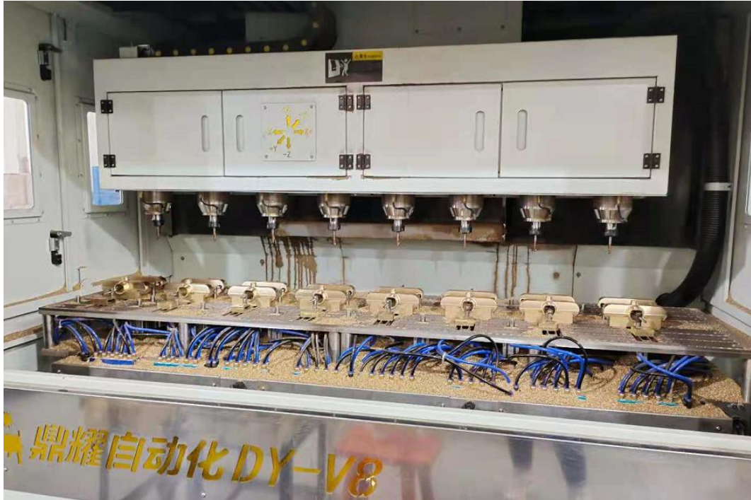
4 milling machines