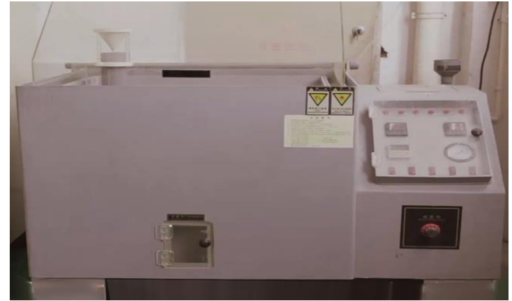
Salt spraying testing