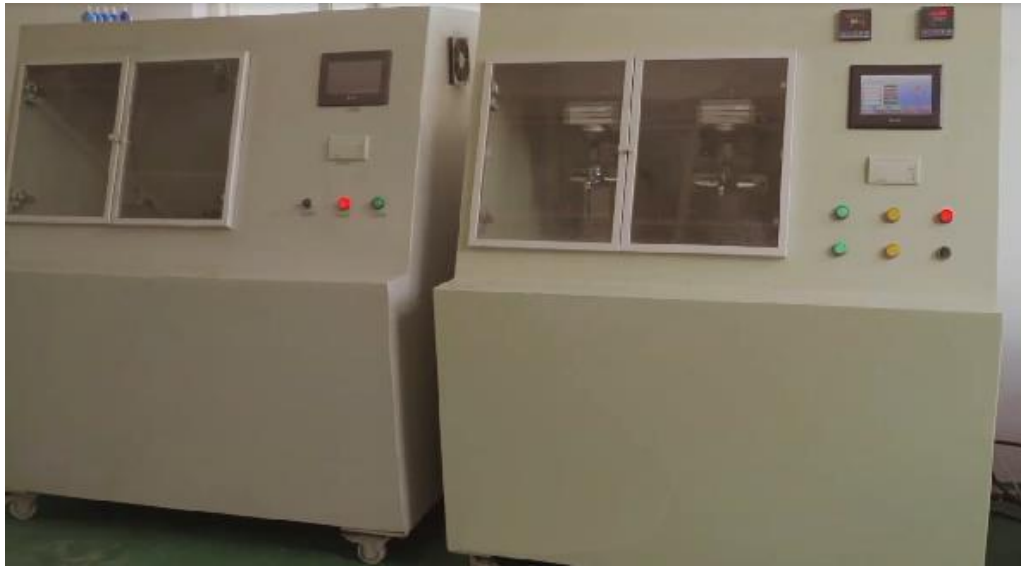
Flow rate testing