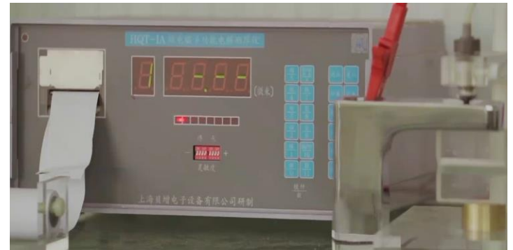
Chrome plating testing